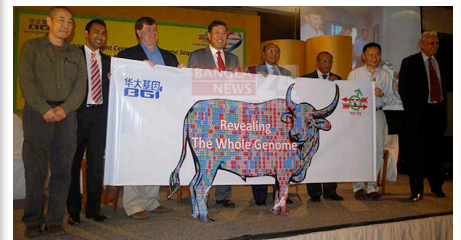
Officials from La Teer Livestock, Ltd. and BGI unveiled their draft water buffalo genome decoding work in Dhaka, Bangladesh on Jan. 24, 2014.

The official language of the Asian Buffalo Congress is English.