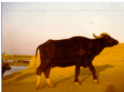
An Iraq Kuhzestani buffalo, Antonio Borghese, 2013

Additional steps are underway in Iraq to construct dairy facilities, feed plants, and veterinary centers. A cooperative, multi-disciplinary approach, combined with restoration of the wondrous Mesopotamian Marshlands, are continuing to help rebuild water buffalo populations in Iraq.